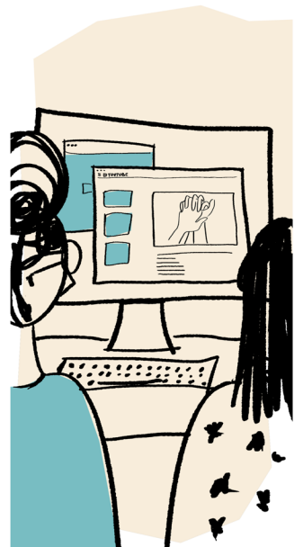
"we found some instructional videos"

Have a story about a great advocate? Get in touch and tell us about it!